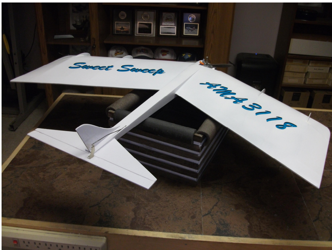
Your editor's Sweet Sweep is finally ready to be flown - circa 1956