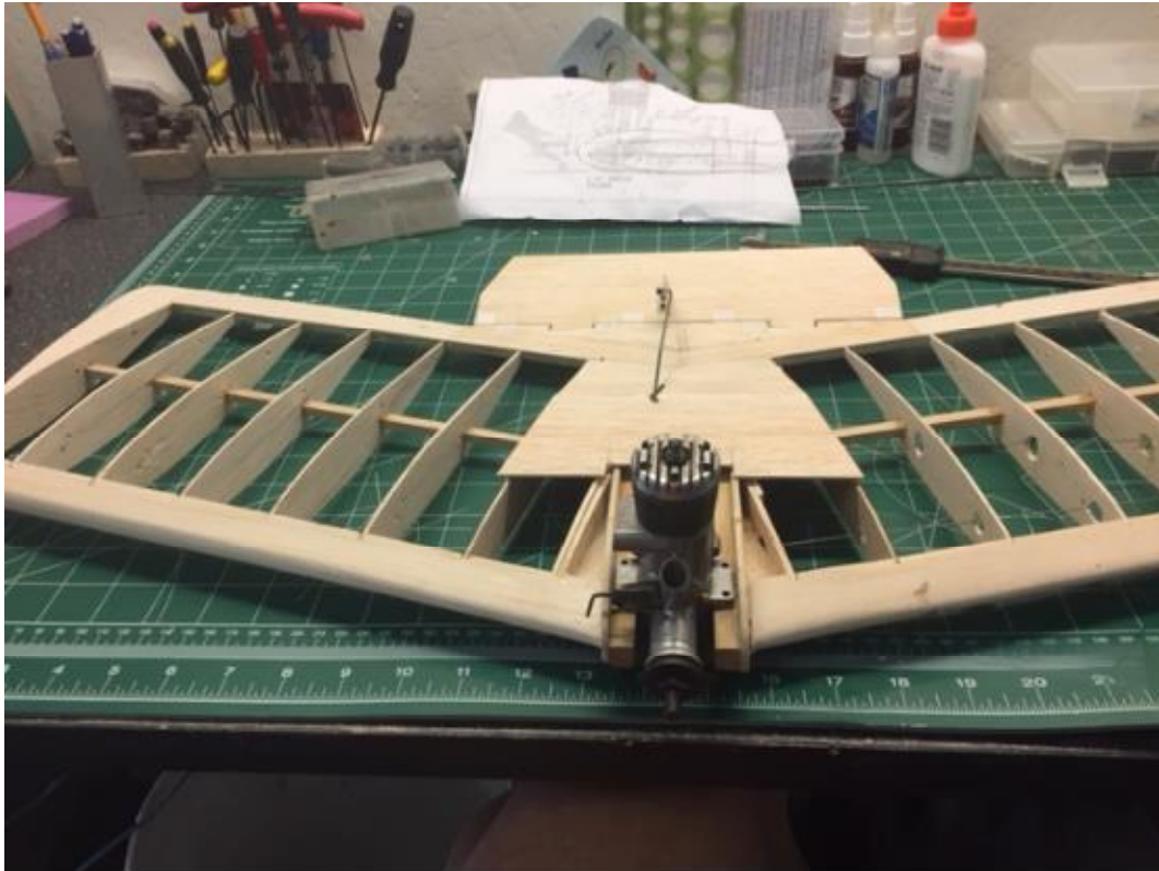
Barry Baxter has a Super Nose Cone almost ready for covering. Cleveland Kit - circa 1958