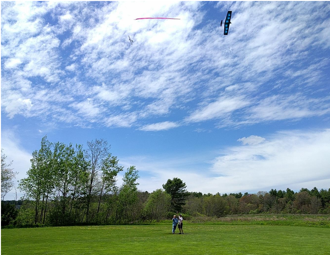
The Wingbuster Field was very green . . . cloud cover near contest end got quite difficult . . . Can you see the second airplane ? . . . I had the same problem.