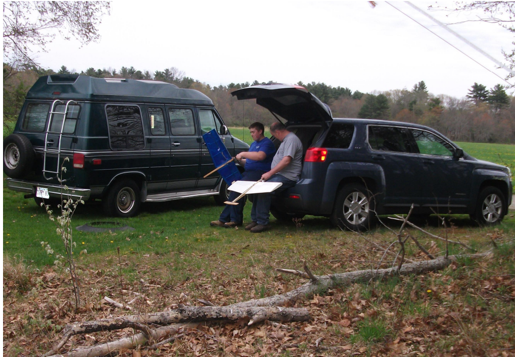
Cody and Bill Bishop prepping a plane for a match