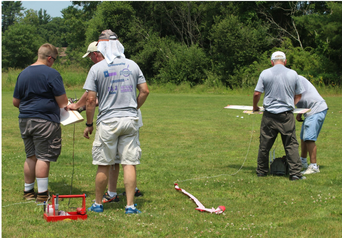
More Action from the same match