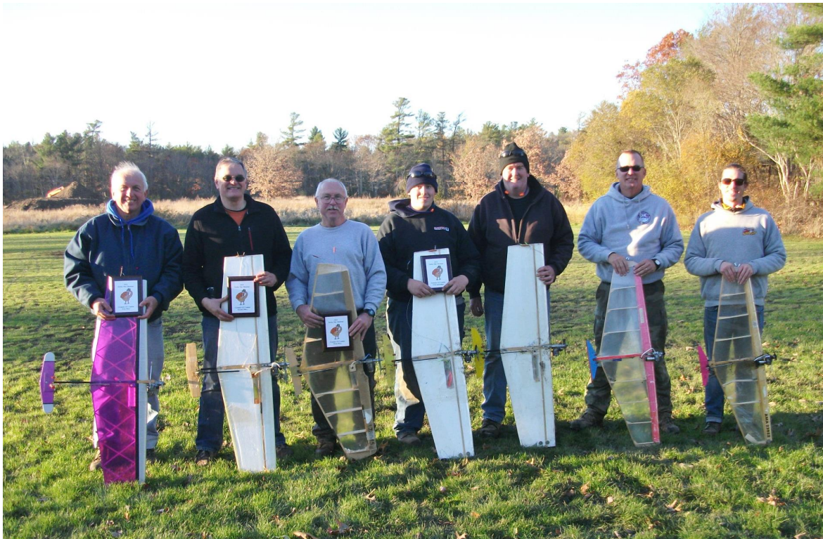
Group photo at contest end-all the brave souls who were on hand for this one