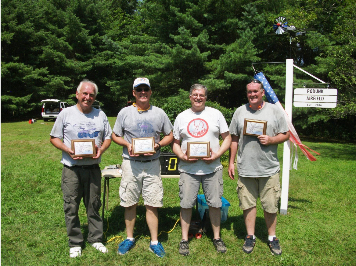
The Podunk Airfield in East Brookfield, MA was the location for the 2018 Central Mass Championship held August 5th