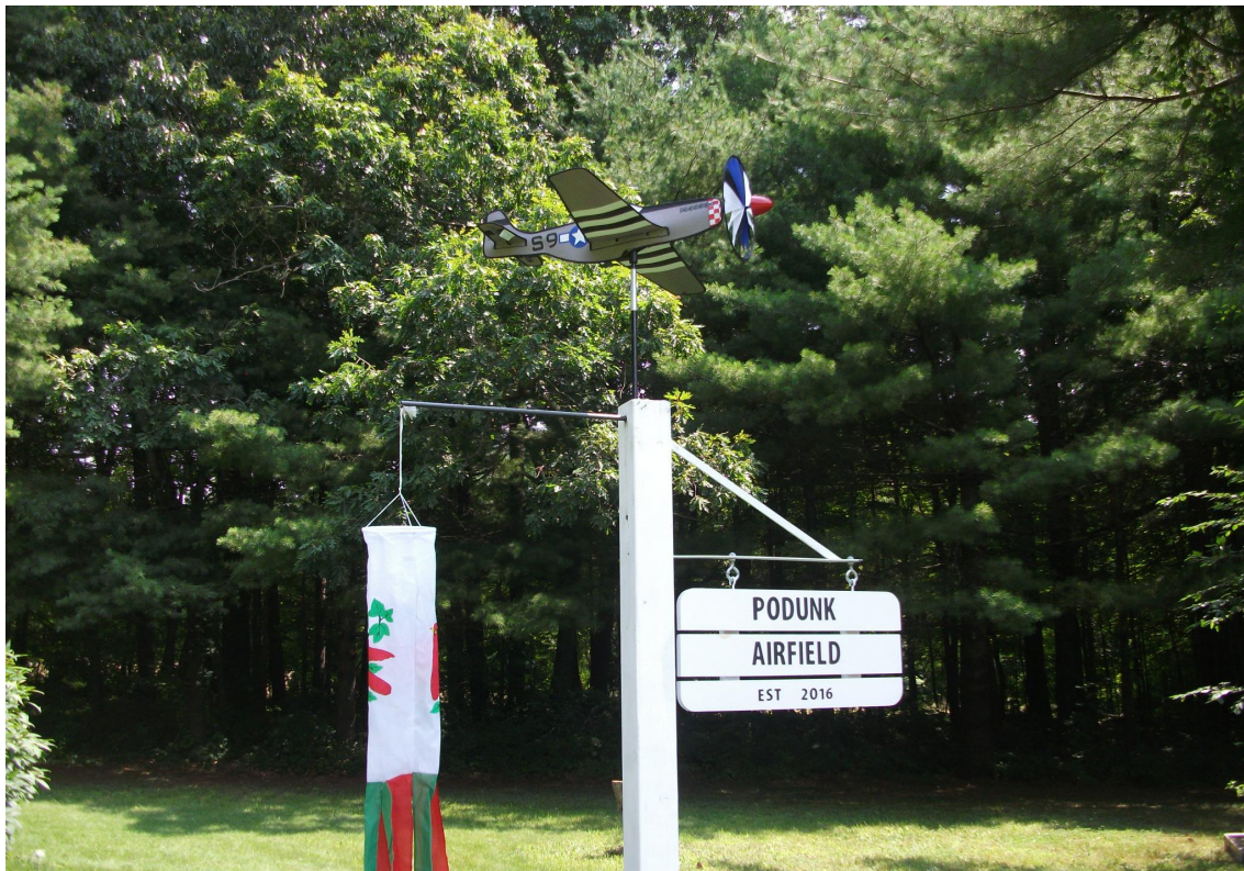
The Podunk Airfield was the site for the 2021 Central Mass Championships More photos on the following pages