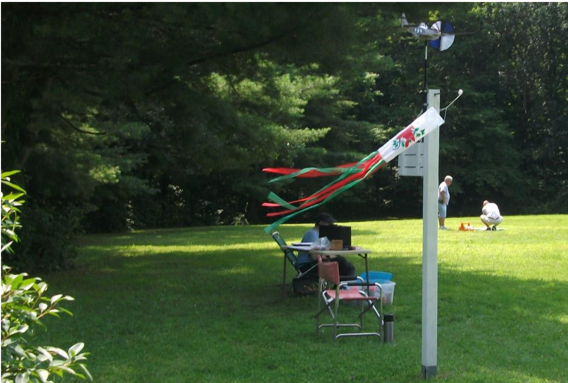
The scorer's table is in a comfortable spot !!!