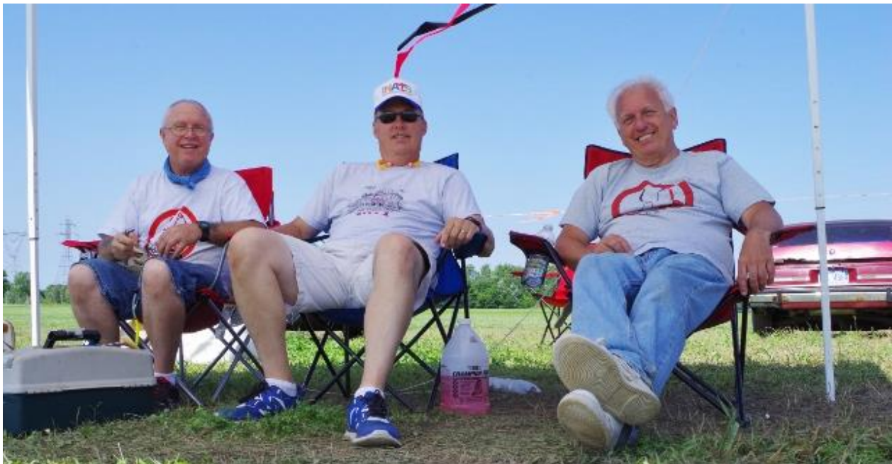
The "Boys of Summer" at the 2015 Nats